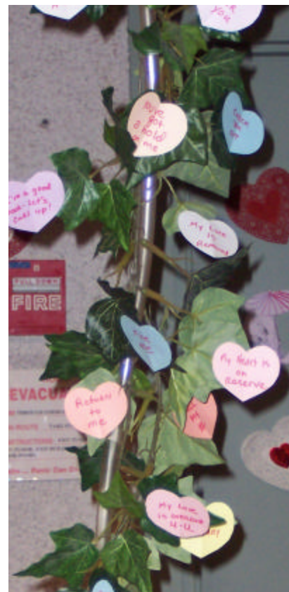
Hose decorated for Valentines Day!