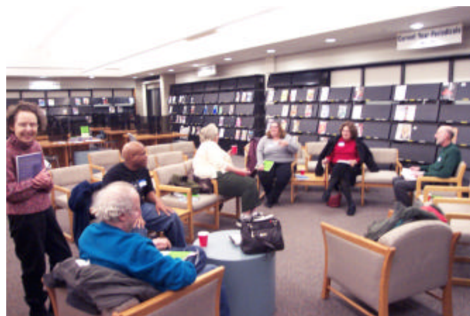
Lively discussion group at the first Modern Marvels session, January 23, 2008.

For more information call Tom Hyland at 440.525-7066