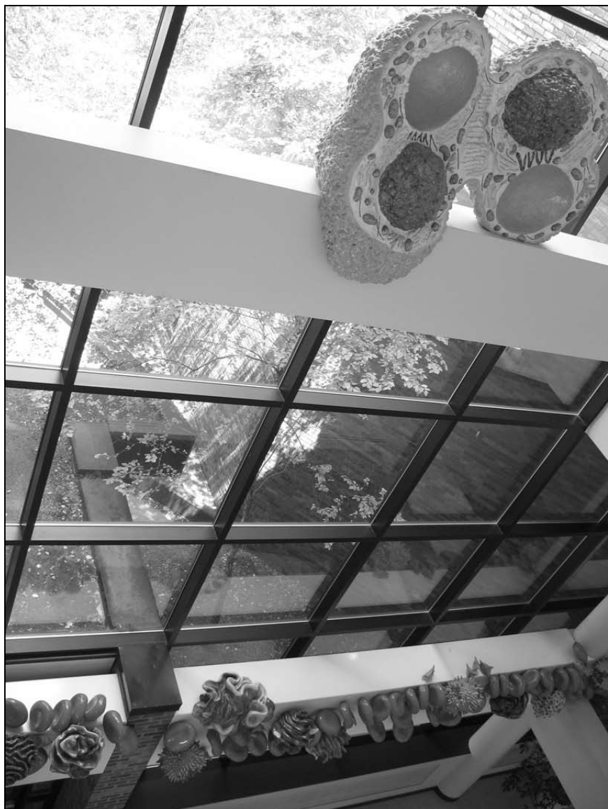
The "River of Life" sculpture is permanently installed in Lakeland's Health Building, depicting the building blocks of blood such as platelets and mitochondria.