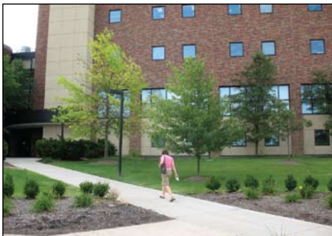
A student walking to class in Lakeland's Health Building.

Healthcare Career Pathways Lakeland Community College • Room H-211d lakelandcc.edu/hcp